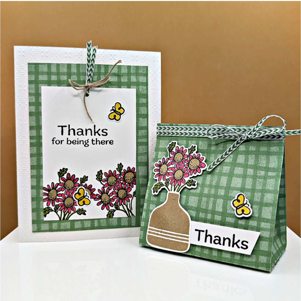
Kelly Acheson - 12 Weeks of Holidays Gift - www.AStampAbove.com